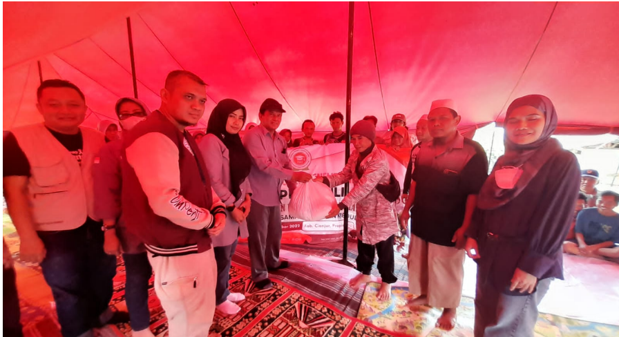
Image: 5. The Cianjur Earthquake Victim Empowerment Team (PDPI)

The needs that are distributed by visitors as donors through volunteers as guard posts in the form of staples for the needs of the earthquake victims. Sutarman., at. Al., (2022) . Are as follows: