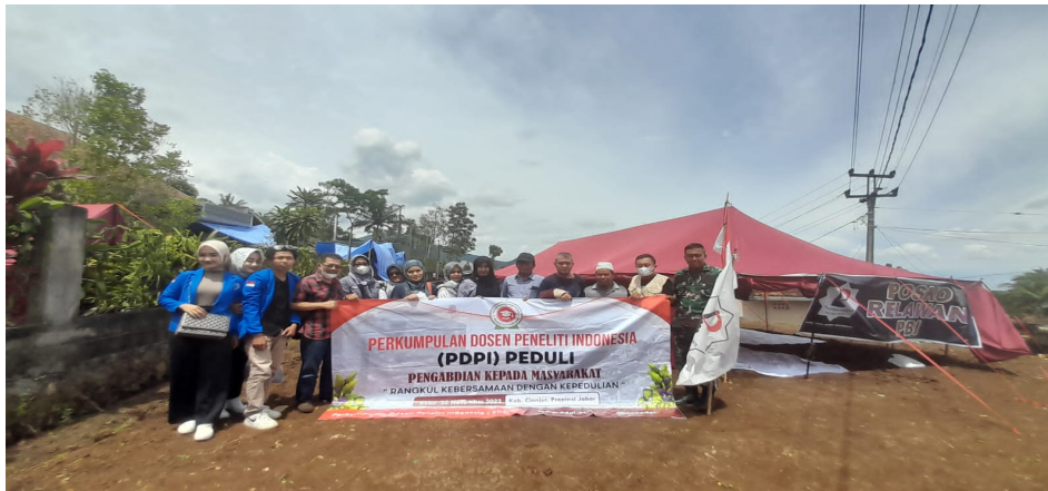
Image: 3. Concern Team of Indonesian Research Lecturers Association