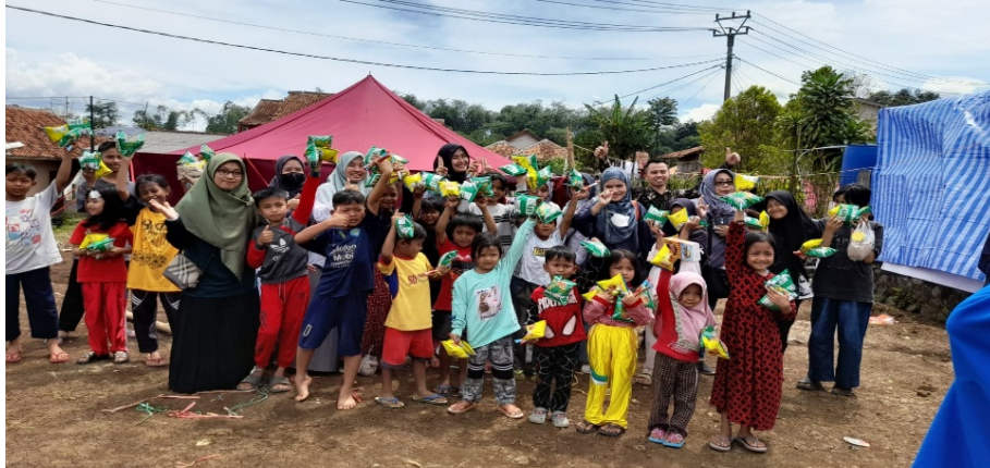
Image: 4. Learning Tutorial Team for Earthquake Victims